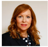
Ash Regan Scottish National Party