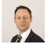
Liam Kerr Scottish Conservative and Unionist Party