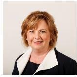
Deputy Convener Fiona Hyslop Scottish National Party