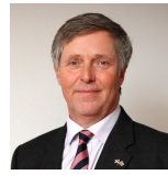
Convener Edward Mountain Scottish Conservative and Unionist Party